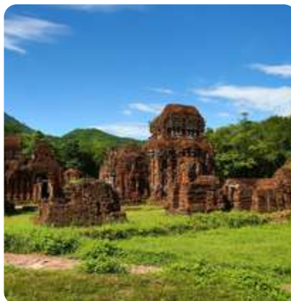
My son sanctuary