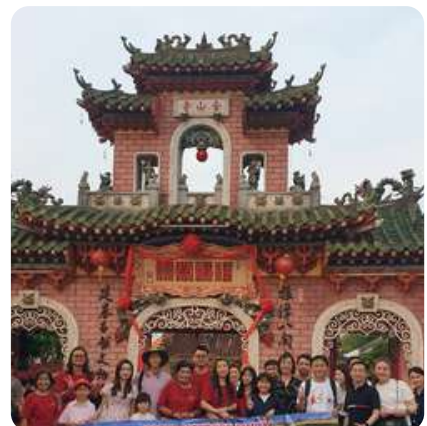
Phuc Kien Chinese Assembly Hall