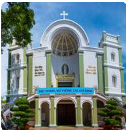
Our lady of Tra Kieu

*Distance from Our lady of Tra Kieu to Hoian ancient town: 20km – 45 minutes for transferring