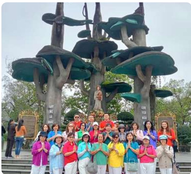
Our lady of La Vang

Distance from Our lady of Lavang – Danang : 150km – 3 hours for transferring